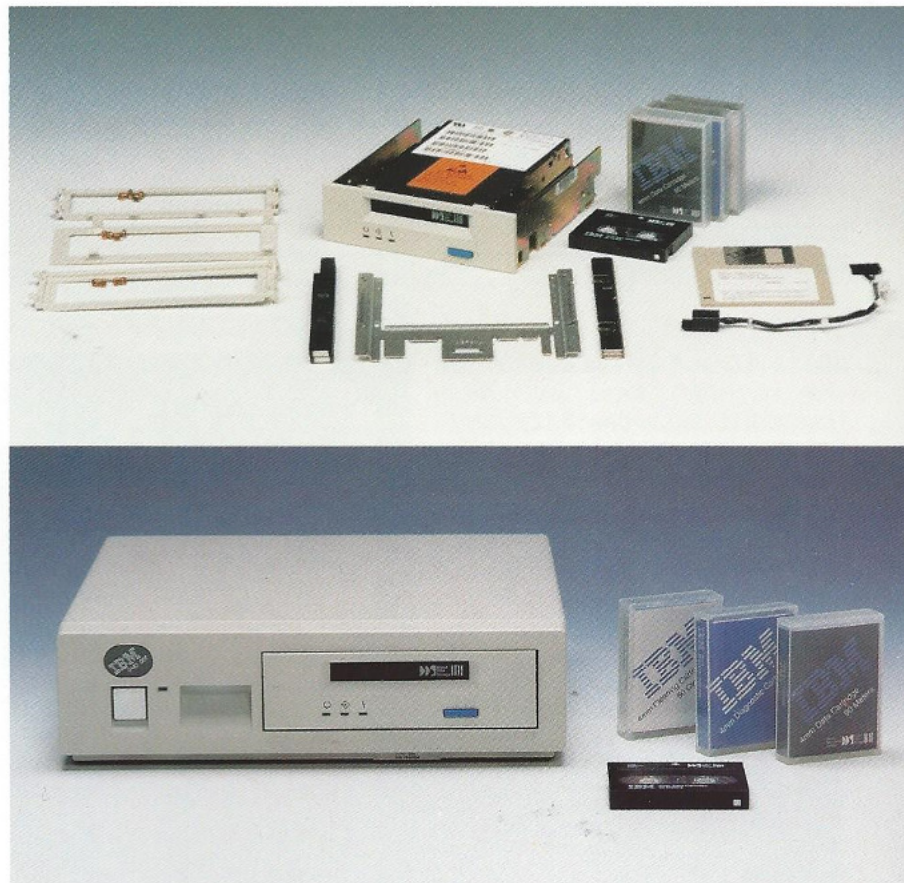
Top: IBM 2.0GB 4mm Tape Drive Option Kit Bottom: IBM 3440 Model 001 2.0GB 4mm Tape Drive with Media

You can back up critical data quickly and easily with the 4mm tape drives. The compact size of the 4mm data cartridges makes them easy to handle and even easier to store. These advanced-technology tape drives can be installed in the system unit or ordered as self-contained standalone units.